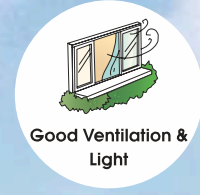
Good Ventilation & Light

S. NO. 61, Plot No. 24/25, Behind Motiwala College, canal Road, Nashik.