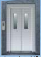
Auto door Lift