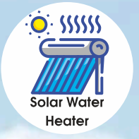
Solar Water Heater