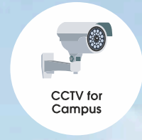
CCTV for Campus