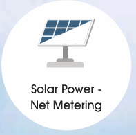
Solar Power - Net Metering